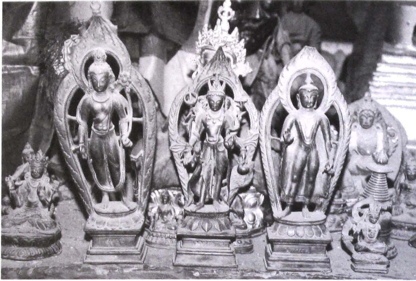
Padmapani Avalokiteshvara (left), Amitabha Buddha (centre) and Gautama Buddha (right), each inscribed to lha na-ga-ra-dza (Divine Na-ga-ra-dza) sPyan-ras-gzigs dGon-po (Avalokiteshvara temple), Tashigang, Kinnaur district, Himachal Pradesh, late 10th/early 11th century Bronze Avalokiteshvara: height 37.5 cm, Amitabha: height 31.5 cm, Gautama: 30.8 cm

During the course of examining scientifically and systematically the material remains of Buddhist monasteries in Khu-nu (the Kinnaur and sPi-ti [Spiti] regions of Himachal Pradesh), three inscribed bronzes were discovered in the sanctum of the sPyan-ras-gzigs dGon-po (Avalokiteshvara temple) at Tashigang in Kinnaur. Tashigang, the last inhabited village before the Indian border with the Tibet Autonomous Region of the People's Republic of China, is situated on the right bank of the Sutlej river. It is located on an international trade route which in former days linked the early mediaeval Indo-Tibetan kingdoms, such as Ya-tshe, sPu-hrans (Purang), Guge, Spiti, Zangskar and Ladakh with